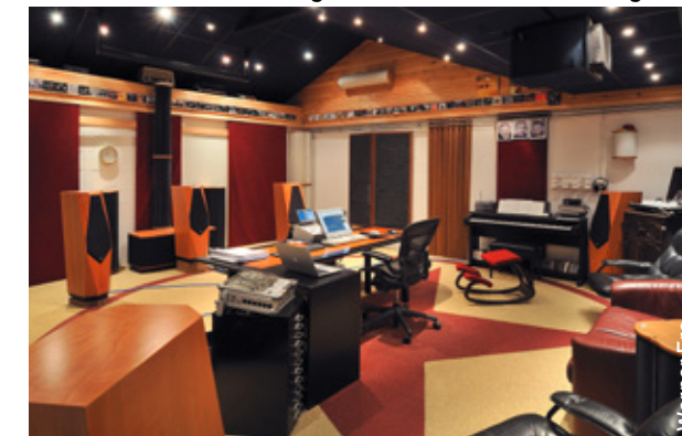
Northstar Studio with High End Surround monitoring