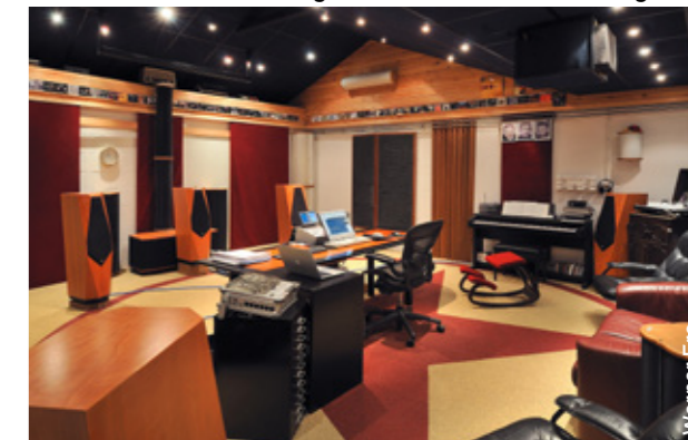
Northstar Studio with High End Surround monitoring